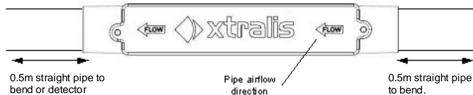
Figure 2 Xtralis In-Line Filter (Top View) – Horizontal Installation

The arrows on the Xtralis In-Line Filter cover indicate the direction of the pipe airflow (Figure 2). The filter should never be subjected to reverse flows.